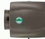
HCWB3-12 Bypass Humidifier 12 gallons per day