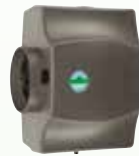
HCWB3-17 Bypass Humidifier 17 gallons per day

Bypass Humidifiers work in conjunction with your HVAC system, using the air handler or furnace fan to direct humidified air throughout the home.