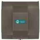
HCWP3-18 Power Humidifier 18 gallons per day

Equipped with a built-in fan, a Power Humidifier circulates humidified air. Since it works independently of your HVAC system, it can deliver humidity even when your system isn't running.