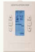
Optional 5-Speed Digital Programmable Wall Control