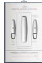
ERV Wall Control