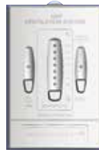
HRV Wall Control

Optional accessories, including timers, digital wall controls, and programmable wall controls, offer enhanced capabilities for your ventilation system. Ask your Home Comfort Advisor for details.