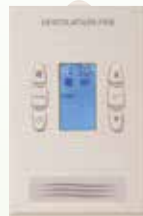
Optional 2-Speed Digital Wall Control